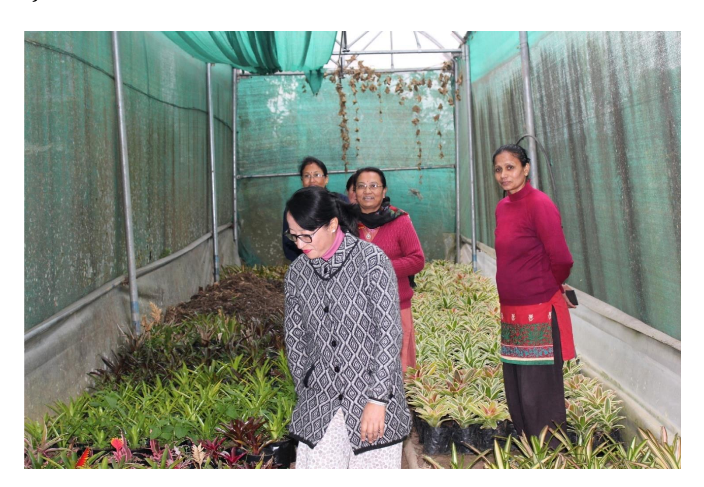
Production of different types of Bromeliads.