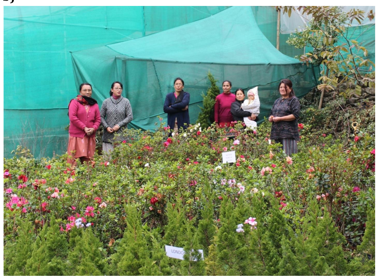
Production of flowering plants and pines